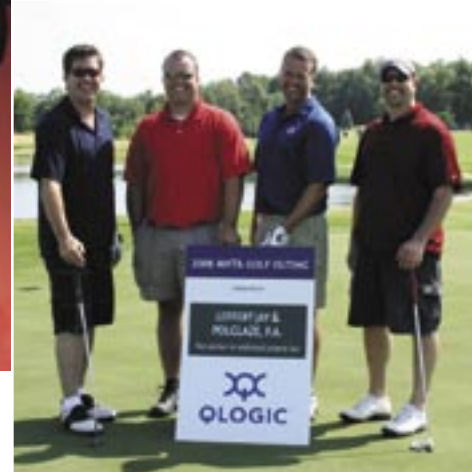
A foursome from QLogic enjoys the links at MHTA's Annual Golf Outing at The Wilds Country Club

TechAmerica WHERE THE FUTURE BEGINS THE ASSOCIATION OF COMPANIES DRIVING INNOVATION WORLDWIDE