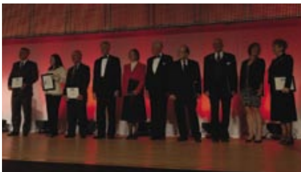
Inductees to the Minnesota Science and Technology Hall of Fame were honored at the Tekne Awards

MHTA and the Science Museum of Minnesota have teamed up to found the Minnesota Science and Technology Hall of Fame. Learn more at www.msthalloffame.org . The first class of inductees includes: