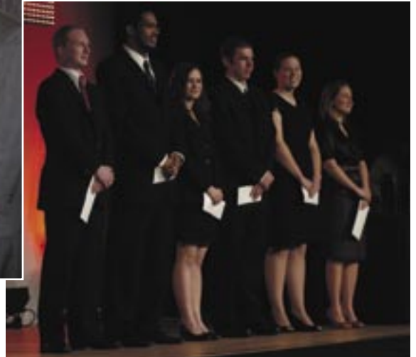
Scholarship award recipients at the 2008 Tekne Awards